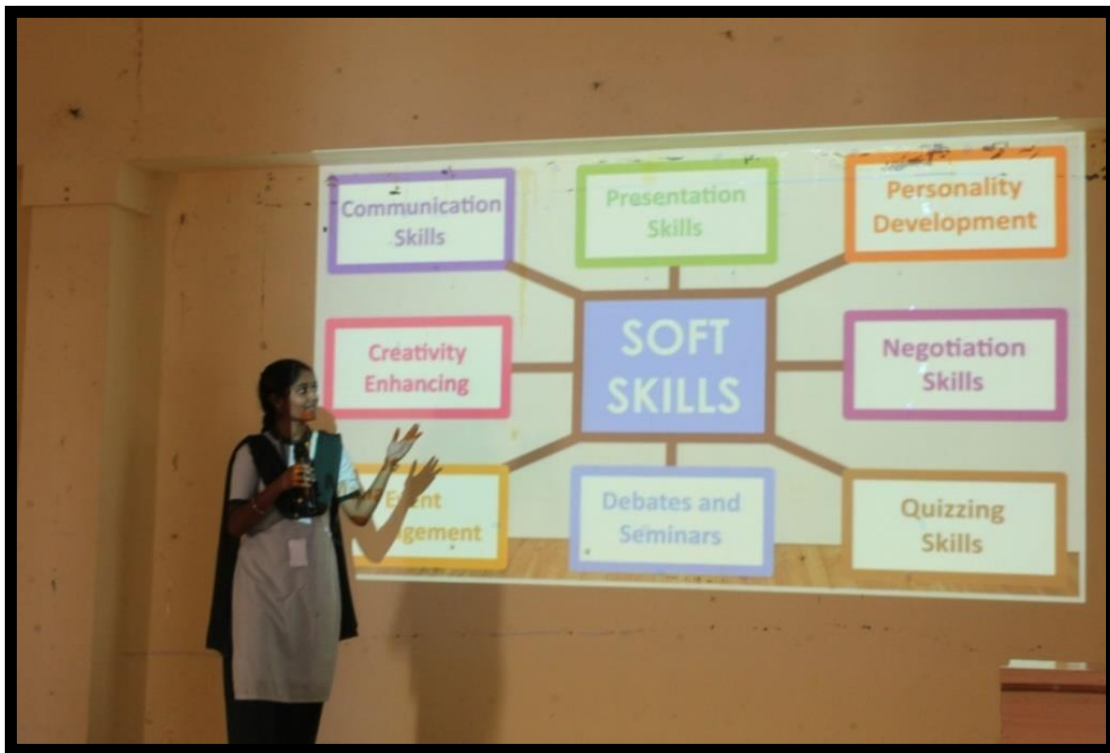
A one day work shop on “Placement Training Session and Soft Skills on 04-12-2020