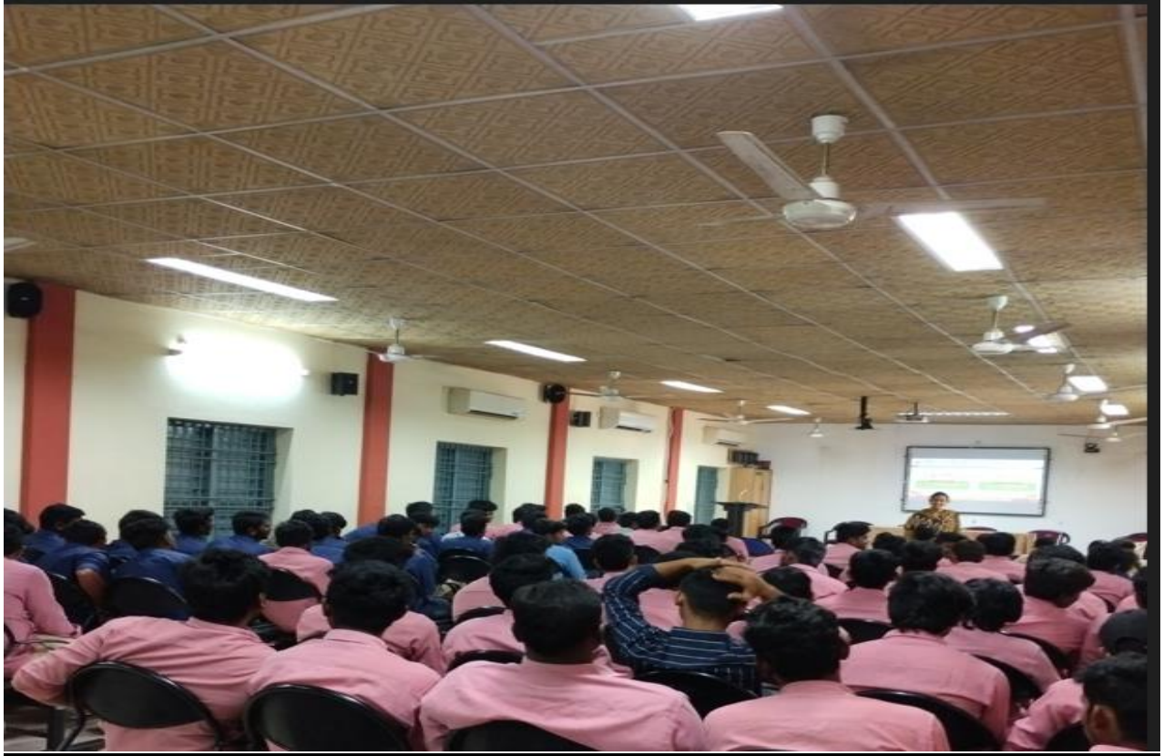
A one day seminar on “Competitive Exams Training on 30.01.2020