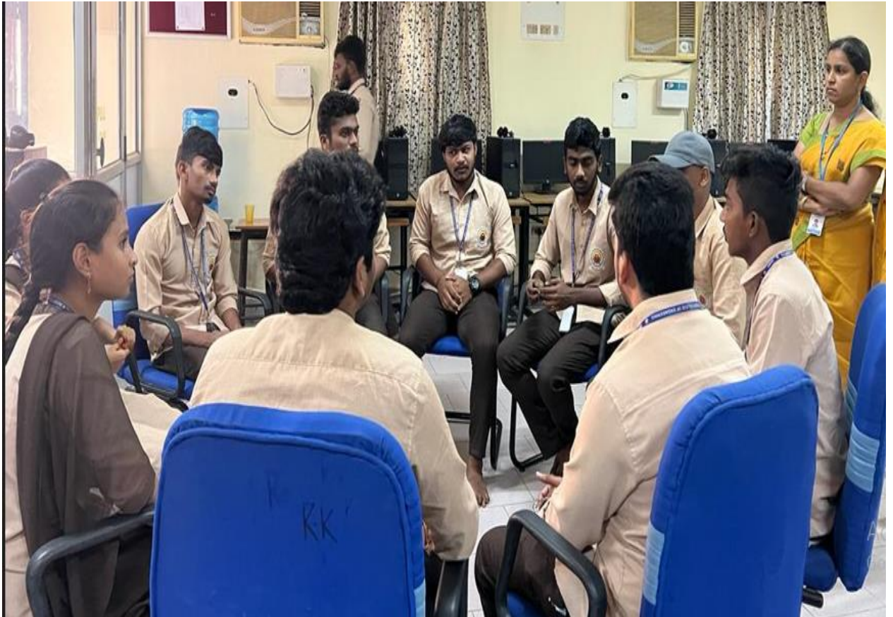
A two day workshop on “Communication Skills” on 29.07.2019 to 30.07.2019