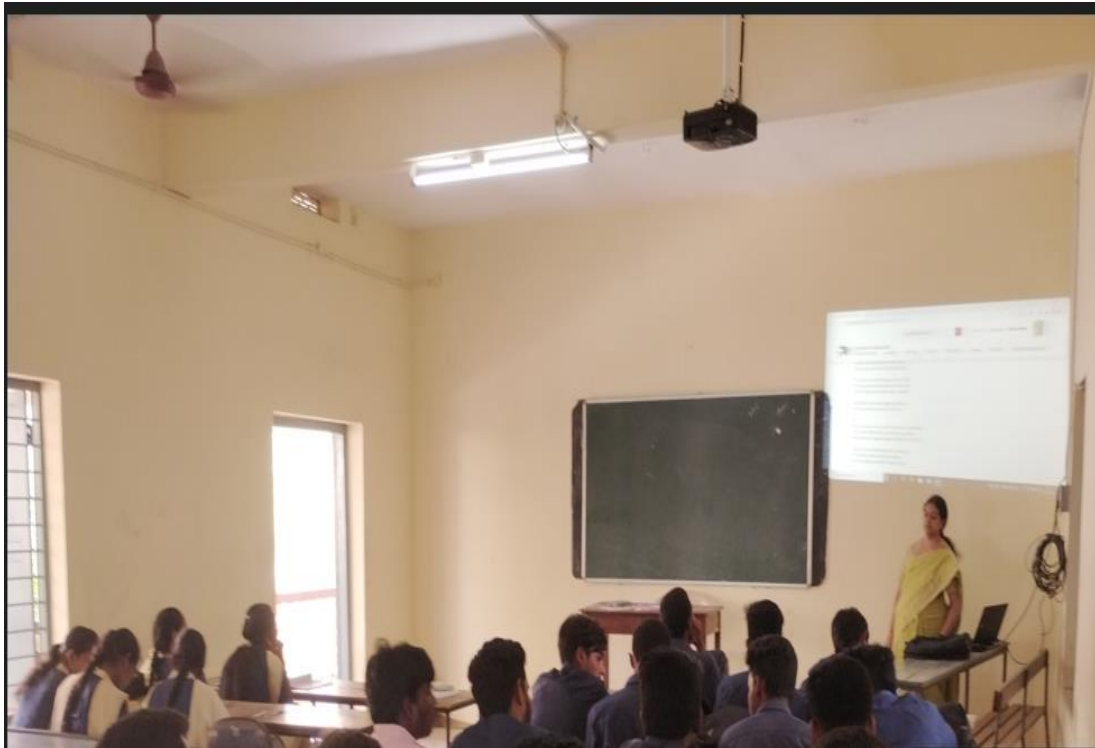
A two day seminar on “Phrases and Idioms”, on 28.08.2018 to 29.08.2018