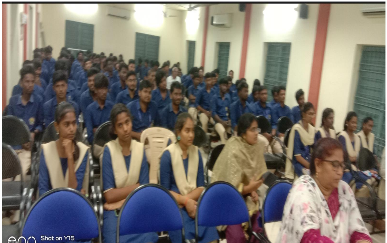
A One day workshop on “Communication Skills and Placements” on 04.11.2020