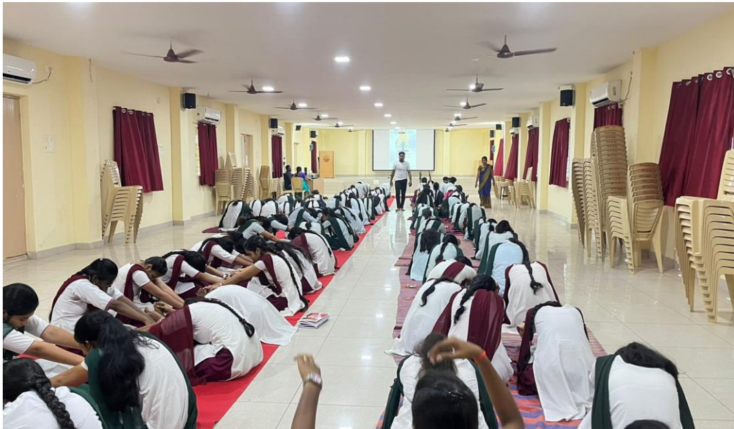
A one day seminar on “How to improve Life Skills” on 01-08-2019