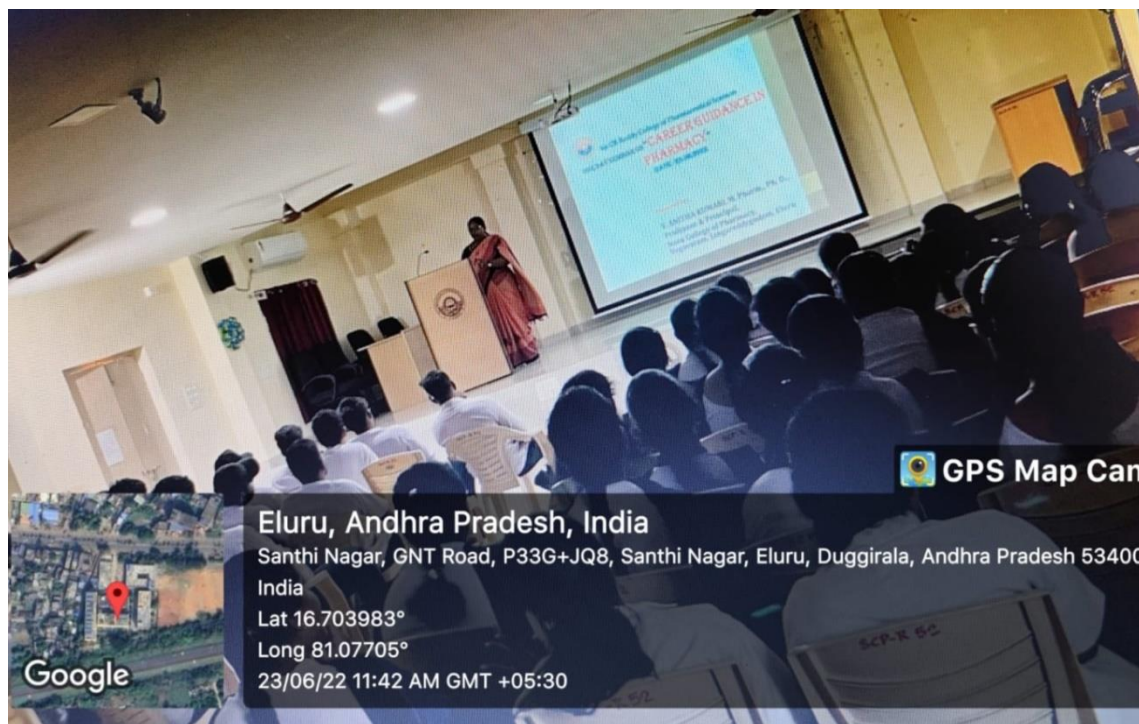
A one day seminar on “Career Guidance in Pharmacy” on 23.06.2022