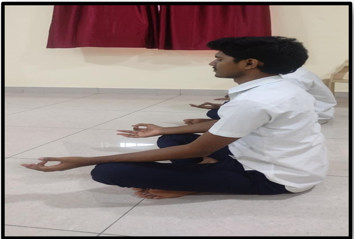
A one day programme on “Meditation, a divine life style” on 31.08.2018