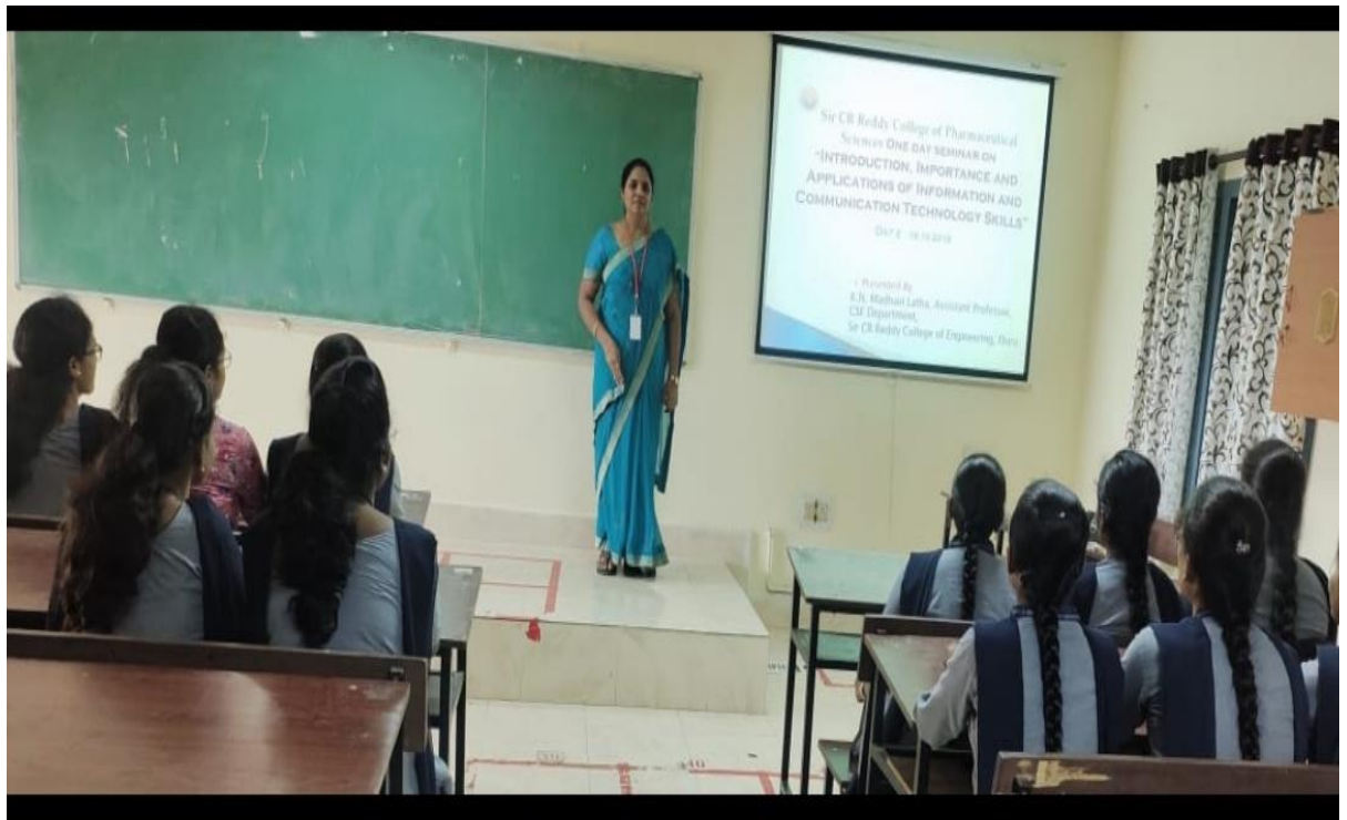
A one day seminar on “Introduction, Importance and Applications of Information and Communication Technology Skills” on 16.10.2019