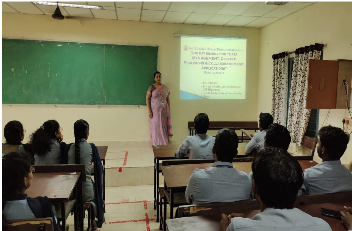
A One day seminar on ICT Skills: Data Management, Desktop Publishing and Collaboration and Applications, on 27.11.2018