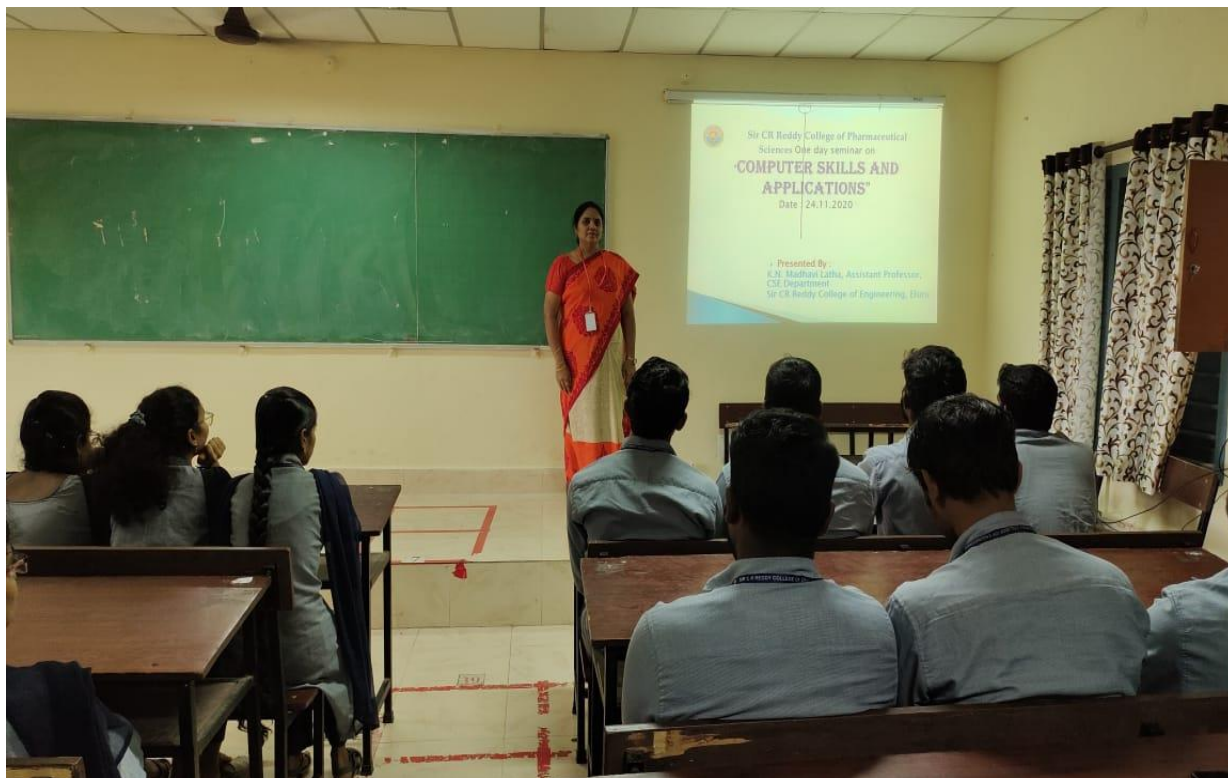
One day seminar on Computer Skills and Applications on 24.11.2020